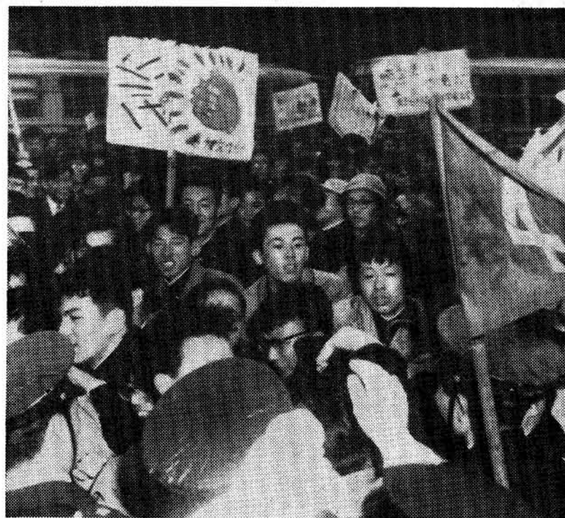
YANKEE GO HOME. One of countless mass demonstrations in Japan against the bomb and against U.S. program to remilitarize country.