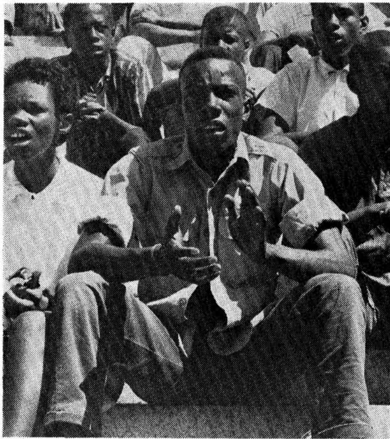
FREEDOM ON THEIR MIND. Danville, Va., rights fighters sing out.