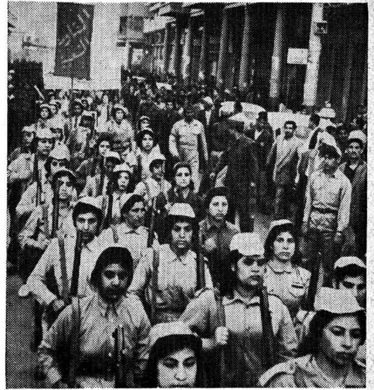
WOMEN'S BATTALION. In first year of Iraq's revolution these Popular Resistance Forces — the common people and intellectuals in arms — saved regime of Premier Kassem from 1959 counter-revolution attempted by pro-Nasser army officers and reactionaries. But Kassem stifled and witch-hunted these and other organizations of workers and peasants. When pro-Nasser officers and reactionaries staged a coup last February, Kassem paid with his life.

The completion of the bourgeois democratic revolution — including the unification of the Arab countries — which is the task facing the Arab people today, cannot be achieved under the leadership of the national bourgeoisie. That can be accomplished only by the pro-