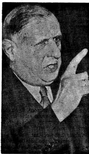
DE GAULLE. To striking French miners he's "Big Charlie." For more on that see page 1 story from Paris.

The postwar boom seems to be over everywhere this time. If sterling is to fall or be devalued — many Keynesian economists here regard this as indispensable to lift Britain out of the economic doldrums — it may well be merely the first followed by all the other Western currencies, including the dollar. For the time being, the bankers have succeeded in holding this prospect at arm's length. But insofar as the crisis of the