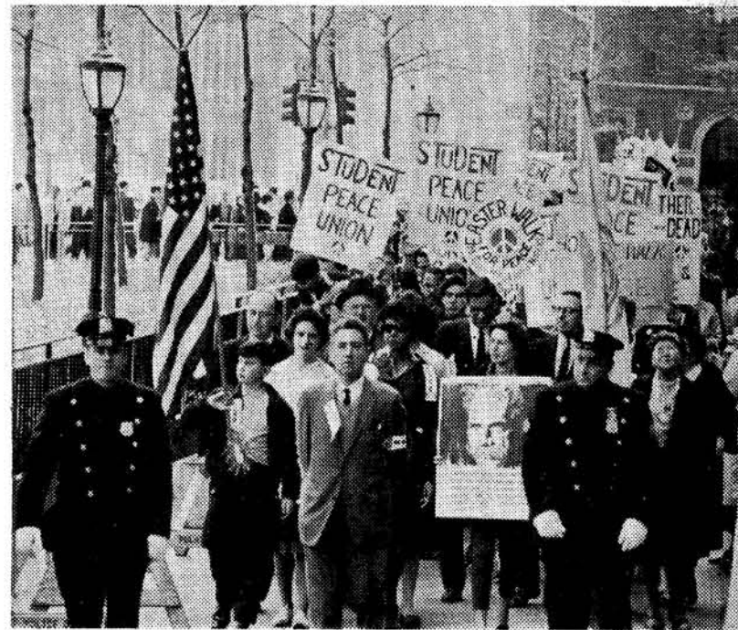
ACTING FOR PEACE. Some of the thousands of New Yorkers who marched on the UN April 21 to demand a halt to bomb tests and the scrapping of weapons of war.

The article also noted that Washington doesn't put too much stock in its propaganda efforts to justify the new test series. Pointing to the already planned press censorship on the Christmas Island blasts and the close-mouthed approach of usually verbose Wash-