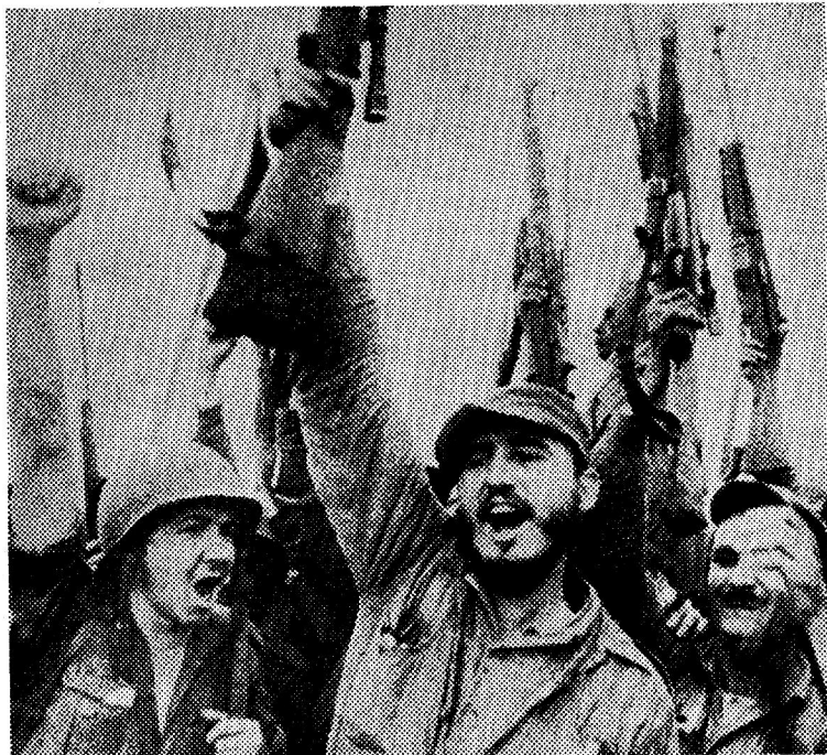
One of the earliest photos of Fidel Castro and the initial cadres of his Rebel Army in the Sierra Maestra mountains.

He rejects as pure propaganda, unsupported by objective evidence or his own close personal associa-