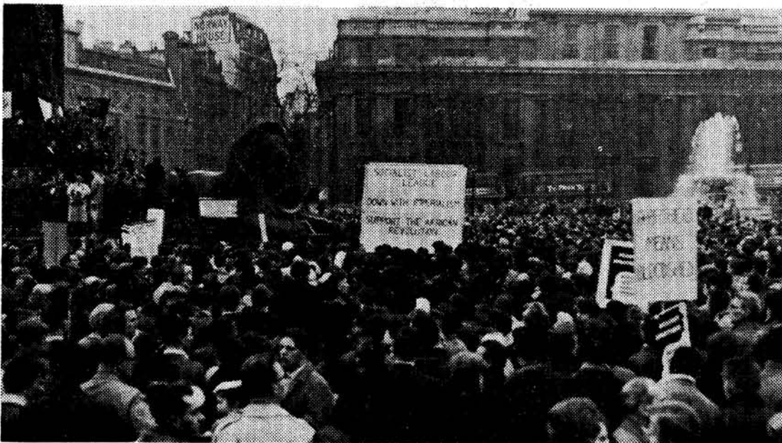
The mass murder of freedom fighters by the Verwoerd government of South Africa was denounced at the demonstration called by the Socialist Labor League in London's Trafalgar Square, April 2. Part of the crowd of 1,700 is shown above. Signs read, "Down with Imperialism," "Support the African Revolution."