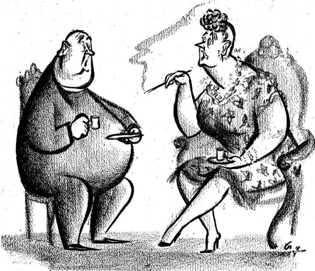
"But without a little birth control the expanding population just won't leave room for people like us."

With such questions on their minds, the Soviet people hardly hear the exhortations of Stalin's heirs. They are thinking of how to win the political democracy that has become absolutely essential if they are to move forward to the real construction of communism.