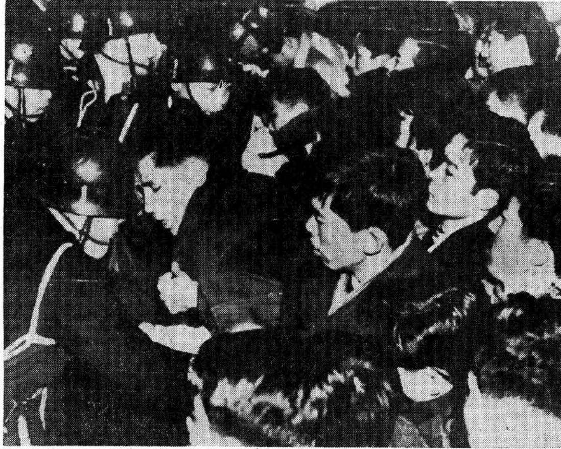
Some 3,000 Tokyo students fight steel-helmeted police at the International Airport in an attempt to stop Prime Minister Nobusuke Kishi from leaving for the United States. Kishi departed for Washington Jan. 16 to sign a new U.S.-Japanese military pact. The Japanese Socialist and Communist parties, the SOHYO labor federation and Zengakuren, leading student organization, have been waging a vigorous campaign against renewal of military ties with the U.S.