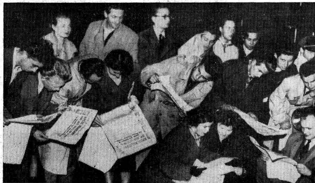
Polish youth are shown above as they excitedly look over the news of victory in Poland's defiance of the Kremlin in October, 1956. The working-class upsurge, which sought an end to bureaucratic abuses, brought Gomulka to power. Gomulka granted considerable concessions to the insurgent workers and students; but instead of going forward to workers' democracy, he gradually withdrew the concessions. Today workers and students are reported to be apathetic; however, a new upsurge may be in preparation that will carry the 1956 beginnings to a successful conclusion.

workers — especially the workers in the Zeran factory district in Warsaw — and students grouped around the CP youth newspaper Po Prostu . Many of them belonged to the Communist party.