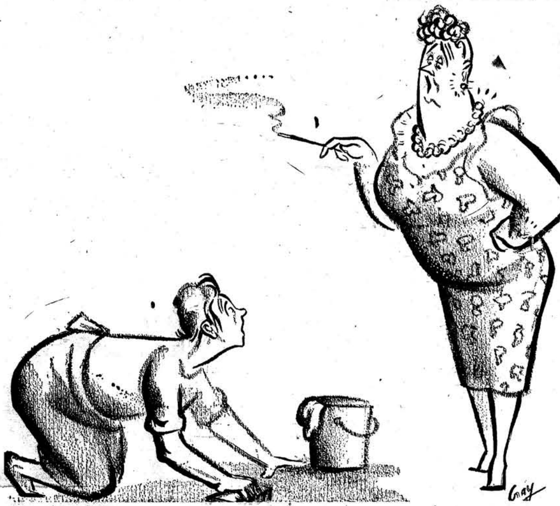
"You know the new anti-union law makes featherbedding illegal, so we'll have to reconsider your Thursday afternoons off."

The shooting in Laos is thus one of the end products of State Department intrigues.