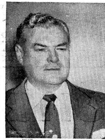
United Steelworker President David J. McDonald: "I'm all through with the Democrats. And I'm all through with C.O.P.E. From now on, I'm sticking with my friend Dick Nixon."

Both the Republican and Democratic parties are subject to their unquestioned control. The machines in turn dictate to the individual Congressmen. These may want to keep their "pro-labor" records clear if they have been elected with union support. But this vote-getting considera-