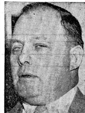
AFL-CIO president George Meany: Labor "is quite definitely in a bad fix"; but we have not "reached the point of a third party."