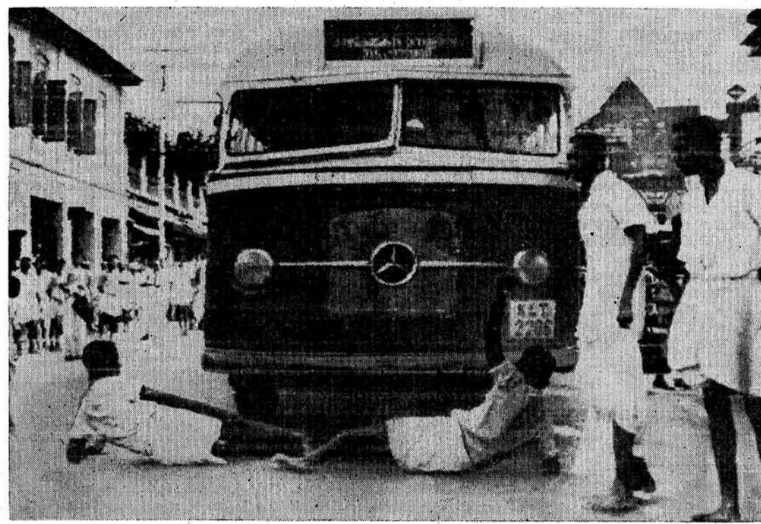
Two opponents of the recently ousted Communist Party regime in Kerala, India, registered their protest against government policies by prostrating themselves in front of a State Transport bus during mass demonstration. See story on page 2.