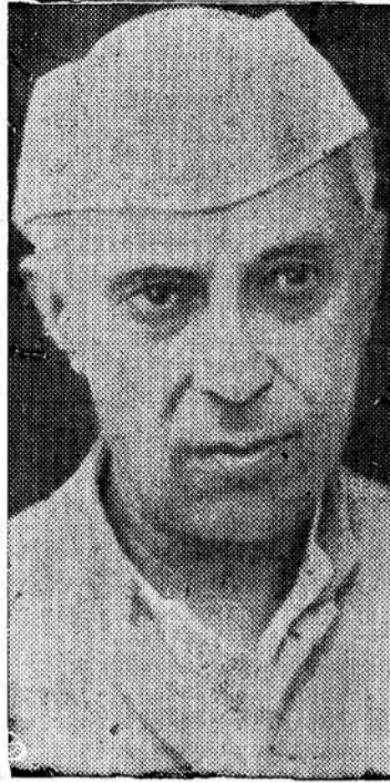
Indian Prime Minister Nehru who utilized popular discontent with Kerala Communist Party regime as justification for ousting it from office.

"Did our workers die of Communist bullets at Chandanathoppu for defending the vested interests? Did the Com-