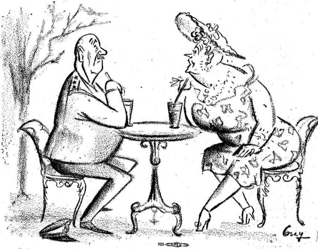
"So what if you can't give orders since you retired. Think of all the orders you've been taking for government contracts!"

To remove this parasitic growth on the viable economic system is the number one problem confronting the Soviet working people in their struggle to build socialism.