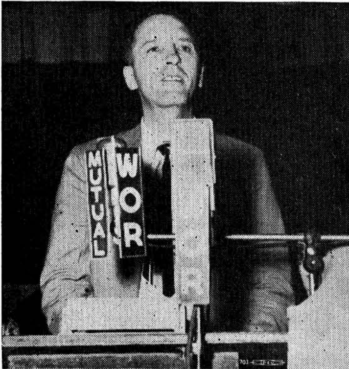
Farrell Dobbs, 1956 SWP Presidential candidate, bringing message of socialism to the American people in a broadcast made possible by "equal-time" law. Current moves to kill law are designed to limit air waves to candidates of Big Business.

(Continued from Page 1) tion campaigns because the stations could not give equal news coverage to an allegedly vast number of "splinter" and "crackpot" candidates.