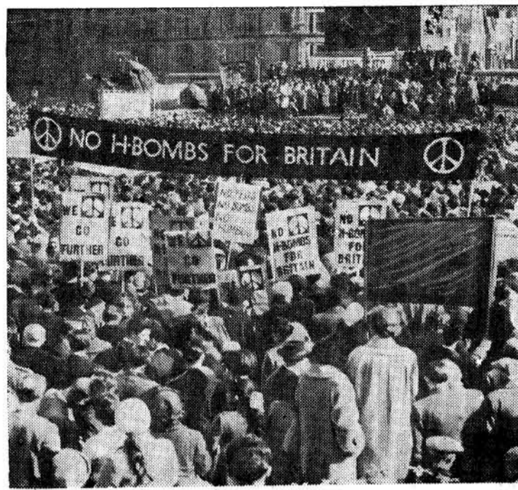
Part of crowd of 12,000 that demonstrated last year in London's Trafalgar Square against nuclear tests. The rally was called by the British Labor Party. Currently, left-wingers in the party are agitating for Britain's complete unilateral nuclear disarmament. A conservative union, the General and Municipal Workers Union, has also demanded recently that Britain stop the manufacture of nuclear weapons and bar them from British territory.

the names contained in the red book of Captain Ramsay we should find that a considerable number of the leading figures in British industry openly professed fascist sympathies in the thirties.