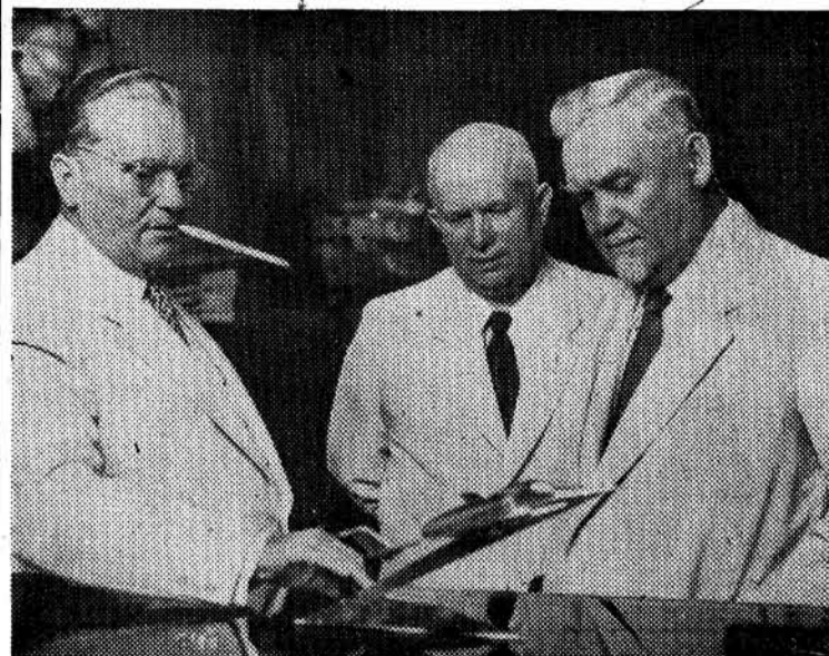
Tito, Khrushchev and Bulganin, shown at time of Soviet-Yugoslav reconciliation in 1955. Returning from a "peaceful coexistence" tour of Africa and Asia March 6, Tito bitterly denounced as "slander," "lies," and "warmongering" the new anti-Yugoslav campaign of Eastern Europe Kremlin-dominated regimes.

"use its influence" to halt the revolutionary opposition of the workers to capitalism. The net result was that the real deterrent to the imperialist anti-Soviet drive—the revolutionary opposition of the workers to capitalism—was weakened and the capitalist world was able to step up its anti-Soviet war preparations.