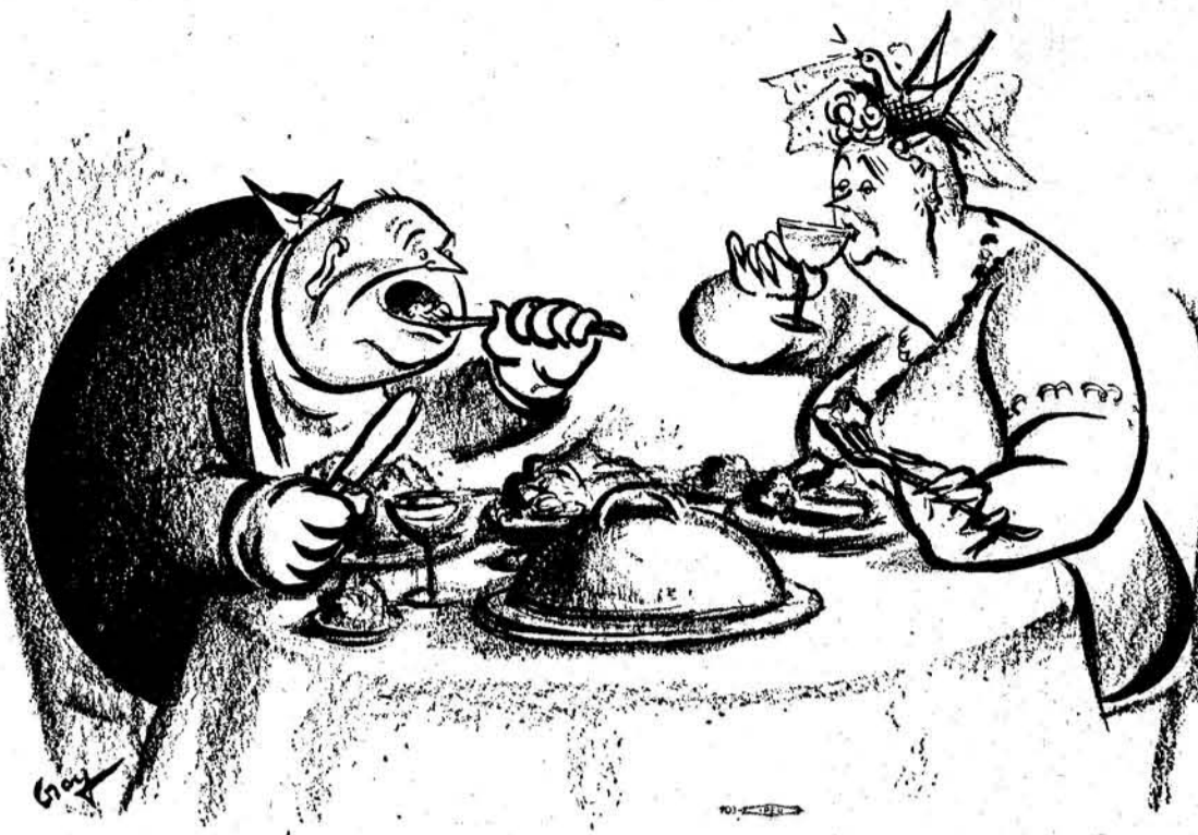
"Consume more! That's the answer to recessions." "Yes, dear. And it helps out the Slenderella people, too."

Meanwhile the Pentagon's fishing expedition did succeed in providing fresh sensational material for all those interested in keeping up the cold war.