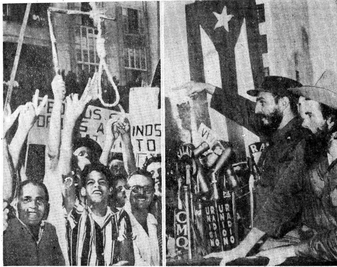
More than half a million Cubans massed in Havana Jan. 26 demonstrating approval of trials of Batista gunmen. One man held rifle aloft as symbol of the penalty earned by torturers and assassins. Fidel Castro told rally that protests in Washington against executions were "infamous."