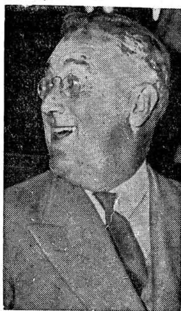
Carefully cultivated legend presents the late Franklin D. Roosevelt as a champion of civil liberties. But the FBI enjoyed its greatest period of expansion under his administration.

the FBI's budget amounts to $102,500,000. There are now 14,000 FBI employees; 6,000 agents and 8,000 clerks distributed through 53 field offices, with an operating fleet of 3,104 passenger cars. Each field division is equipped with a radio-telephone system for communication with their vehicles.