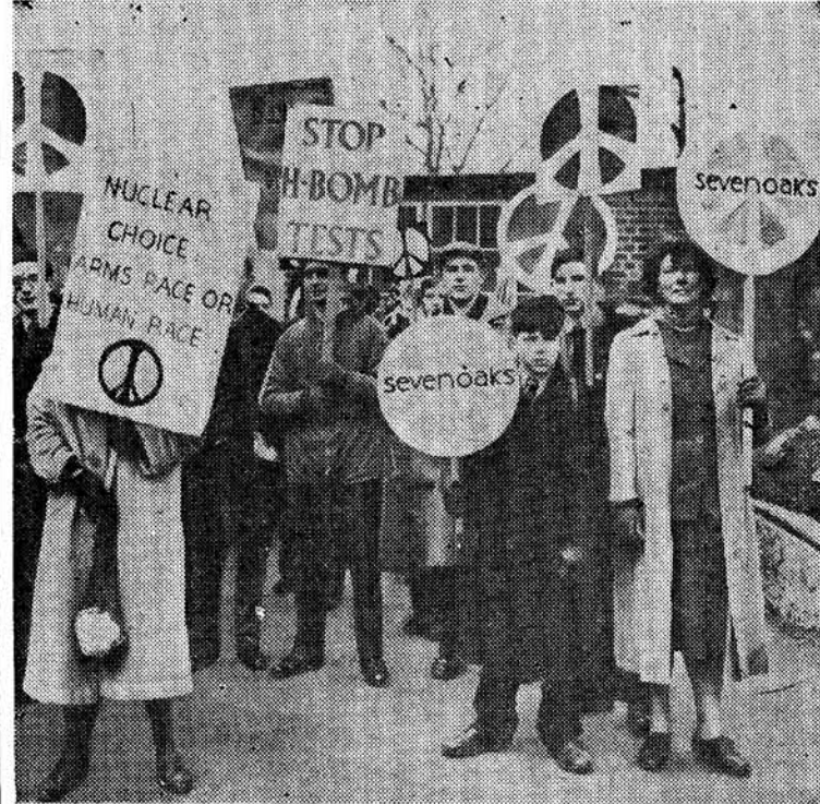
Demonstrating against British nuclear-arms build up, pacifists staged a London prison-to-prison parade Jan. 27. They marched from the prison where male members of the group are being held on charges of "disturbing peace" to prison where female members are jailed on the same charge.