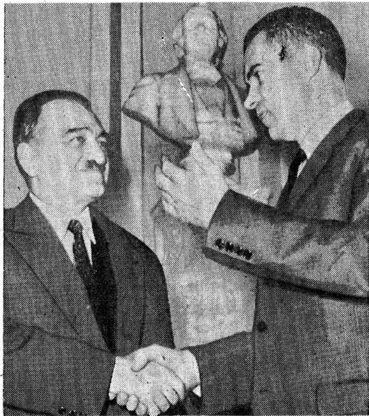
Soviet First Deputy Premier Mikoyan (left) invites U.S. Vice President Nixon to visit the Soviet Union as second-ranking head of American government. Nixon left the invitation open. The White House has not yet indicated if it intends to reciprocate the Mikoyan tour.