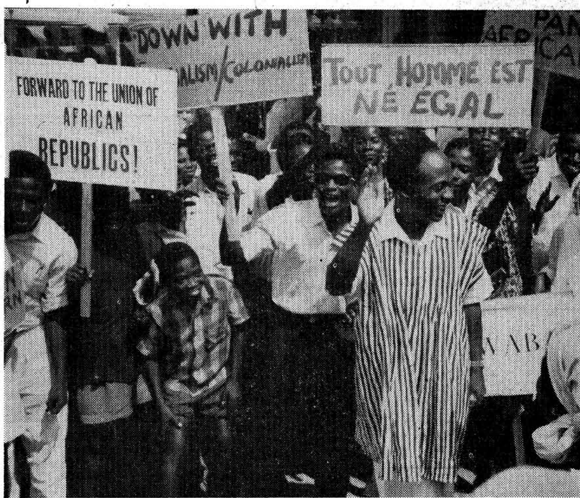
Kwame Nkrumah (in striped robe) celebrates with crowd at entrance of building where the first All-African Conference was held in Accra, Ghana. The gathering, which called for a United States of Africa stirred fresh hope among freedom-seeking Africans throughout the continent.

To make it a finale up to Hollywood's best, we suggest that the Academy award itself an Oscar for the year's outstanding return to virtue. We do this despite a suspicion that like other Hollywood heroes, our Academy has its eyes on the ticket booth and that it will ride again into sin and peril, especially if the scenario calls for a few pithy lines on how much better artists are treated in the USA as compared to the Soviet Union.