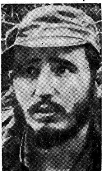
FIDEL CASTRO, leader of popular Cuban uprising, warns against U.S. intervention in internal Cuban affairs.

In the giant Havana rally, the people of Cuba voiced their determination to decide the question of justice for themselves. Criticisms from Congress have stiffened this determination.