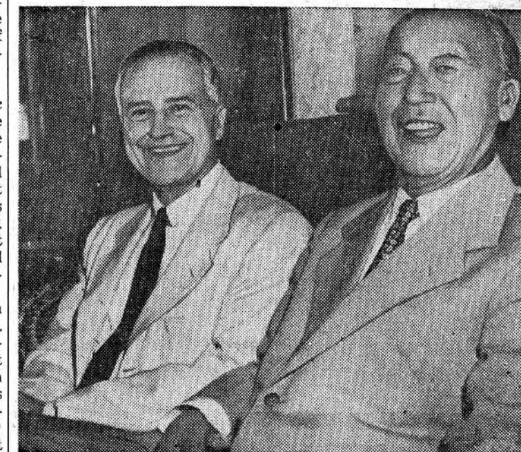
Korean dictator Syngman Rhee and Walter Robertson of the State Department beam happily at time of Korean truce. Washington is beaming less today as Rhee's new dictatorial measures provoke an internal crisis. Rhee points out that the U.S. government also takes steps to ensure "internal security."

This answer indicates that Rhee has only the highest interests of the nation in mind and that these interests may compel him to place Chang on trial for violating the new anti-Communist law with his subversive criticisms.