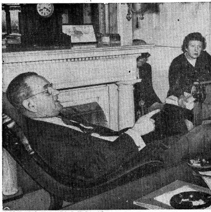
Sen. Lyndon B. Johnson can take things easy because he only needs to wave his finger to get what he wants, especially from liberal Democrats. After getting the liberals to play dead while he stopped efforts to end the Senate's filibuster rule, the Texas leader of the Democratic Party offered his own "civil rights" bill. You're right. Nothing in it about school integration.