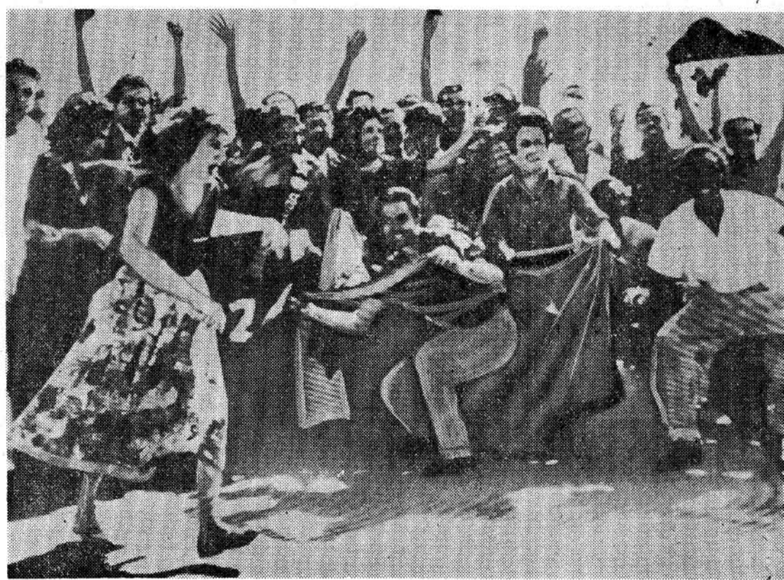
Waving a rebel banner, a Cuban girl dances in the streets of Havana to the cheers of throngs celebrating downfall of the hated Batista dictatorship. Throughout

the capital city and across Cuba, mass demonstrations voiced popular demand for social and economic reforms.