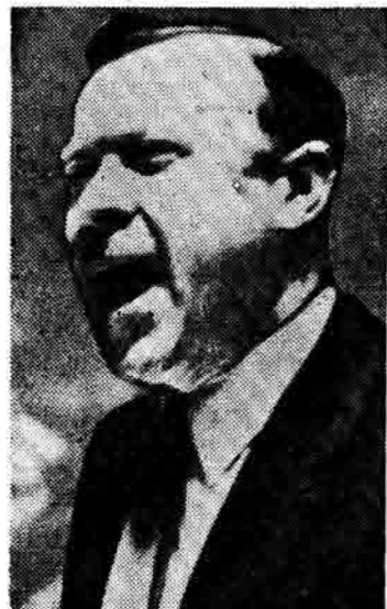
WALTER REUTHER, President of United Auto Workers, which is engaged in fight against ruthless speed-up drive of Chrysler Corporation.

one Dodge worker as follows: "Approximately 8,000 are laid off. The remaining 10,000 are now being subjected to the worst speed-up experience since 1939. On Dec. 20 the whole plant was given a holiday until Jan. 7. Then we worked two and a half days. Seven thousand were given lay-off slips and the rest given another until Jan. 20.