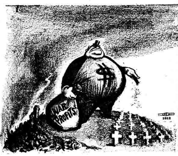
Reprinted from the Militant, August 18, 1945