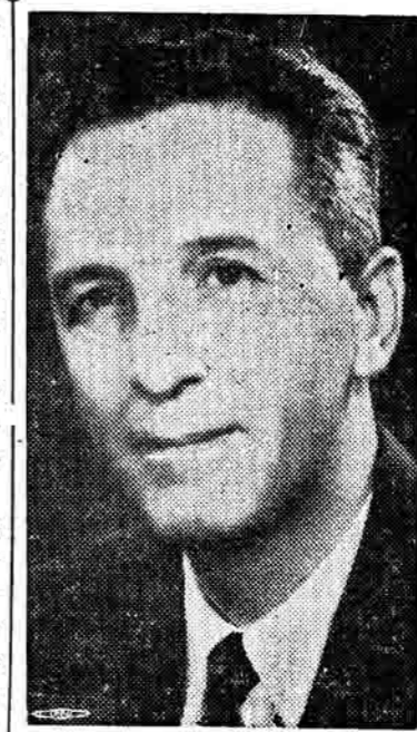
FARRELL DOBBS, National Secretary of the Socialist Workers Party and candidate for United States President in 1956.

"In 1957 a growing tendency for united election activity was manifest. The support of the National Guardian and many prominent radicals to the slate of candidates placed on the ballot by the SWP was an ex-