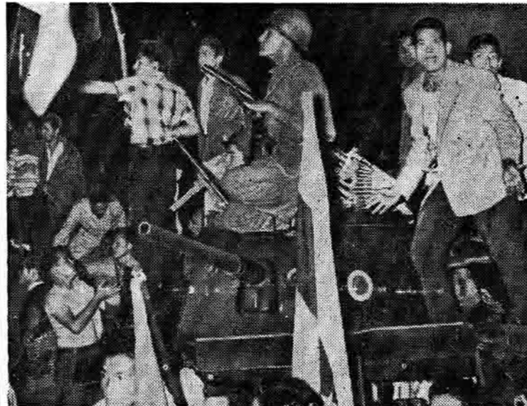
Celebrating the overthrow of the hated Venezuelan dictator, Marcos Jimenez, crowds in the capital city of Caracas swarm over tanks as the army joins the celebrations. The demonstrators freed political prisoners and searched out members of the hated secret police.