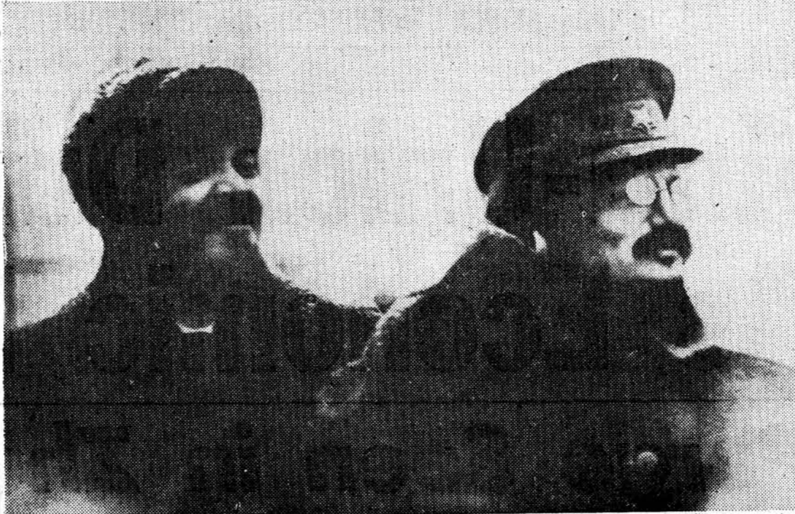
LENIN (left) and TROTSKY together led the Russian working class to victory in the revolution of 1917. The events that brought the workers to power for the first time were subsequently distorted and concealed by the Stalinist falsifiers of history. With the new upsurge of the Russian workers and youth, a search for the true history of these events has begun.

For this reason the new edition of the History of the Russian Revolution by Trotsky, one of the leaders of that great event, is most welcome. In his preface Trotsky writes, "The history of a revolution is for us first of all a history of the forcible entrance of the masses into the realm of rulership over their own destiny." In his work the author shows that the source of every major event in the Russian Revolution can be traced to the profound political processes occurring in the mass movement itself. The fate of the multitude of leaders and political parties that played a role in the revolution is understood in its connection with the developing class struggle. Bread, peace and land—the demands that moved the mass into action—