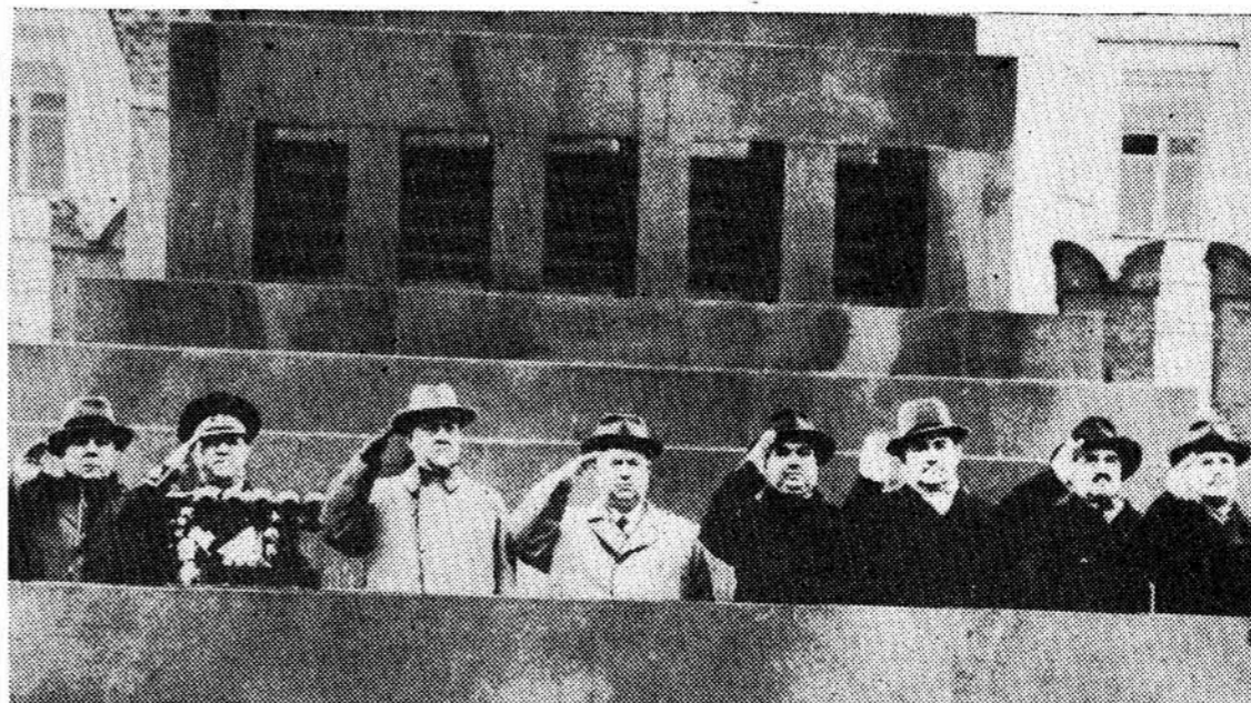
Ranks of top Kremlin bureaucrats continue to thin. Four of the above have been ousted since this May Day picture. From left to right: Vorozhilov, Zhukov (ousted), Bulganin, Khrushchev, Malenkov (ousted), Kaganovich (ousted), Mikoyan and Molotov (ousted).