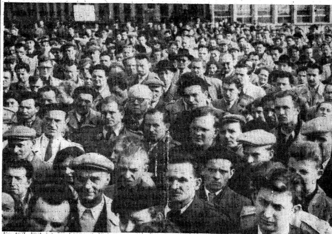
The revolutionary mood of the workers in East Europe can be seen in this view of a mass meeting held at the Zeran plant in Warsaw in 1956. The formation of workers councils in Poland and Hungary showed the way they will end bureaucratic rule and establish workers democracy. Chief Stalinist complaint against workers' councils is their "tendency" to enter into political struggle.

accidental in the development of the workers' council form. The revolutionary class in modern industrial society is the working class, and the power of the working class is based on the fact that it is concentrated by modern productive forces at the very heart of social power.