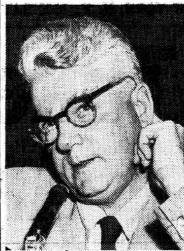
Communist Party leaders Eugene Dennis (left) and John Gates. At recent meeting of the Communist Party National Committee, a group around Dennis emerged in control of party. Since then, Gates has come under attack of Kommunist, a leading Moscow CP publication. (See story, page one.)

Our search for the causes of this grievous aberration soon included an investigation of the works of Trotsky. We had shunned and never read them because they were banned by the Com-