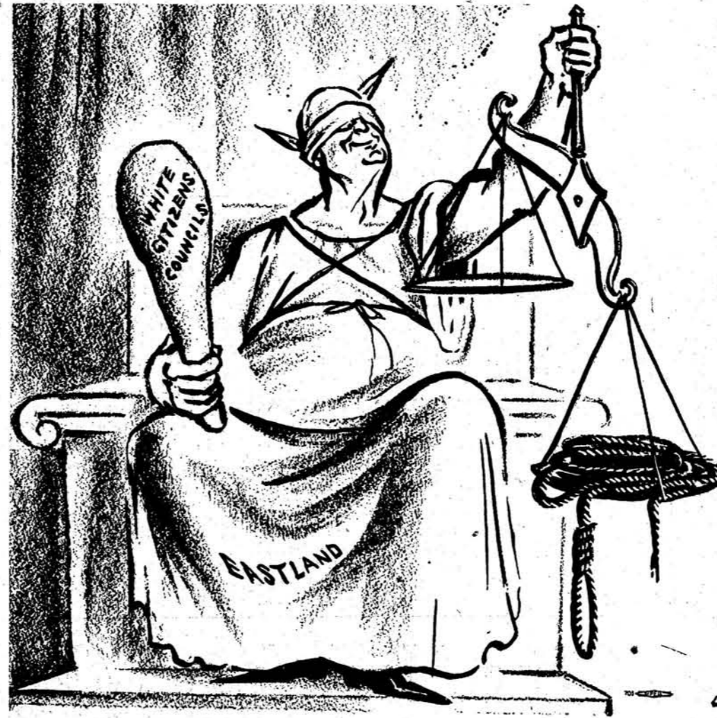
NEWS ITEM: James O. Eastland (D. Miss.) was renamed by the Senate majority last week to the key post of Chairman of the Judiciary Committee.