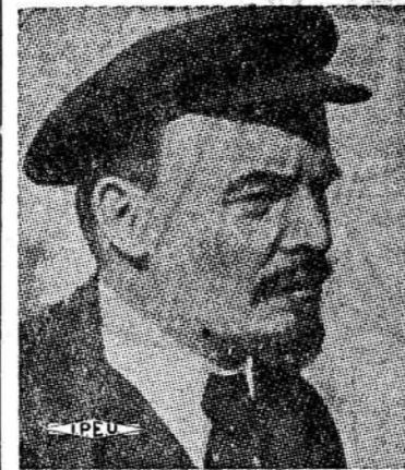
V. I. LENIN