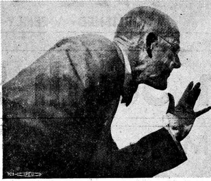
EUGENE V. DEBS on the platform. "Debs never deviated from the class-struggle line in his own public agitation... His stand against the war was magnificent. He supported the Russian Revolution and proclaimed himself a Bolshevik." — EUGENE V. DEBS, by James P. Cannon.

From Cannon's pen comes the picture of a socialist leader worthy of tribute and emulation: "The Marxist theory of the class struggle was the central theme of all his agitation... he would have no truck with the delusive theory that capitalism would grow into socialism through a series of reforms. Debs campaigned for the overthrow of