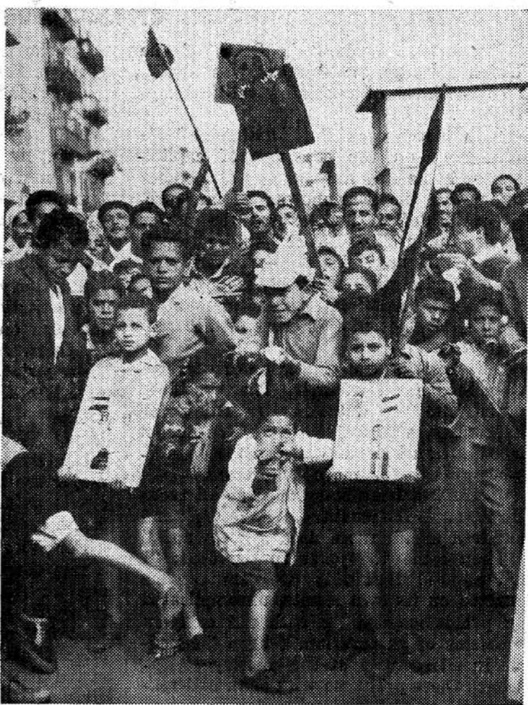
Young Egyptians in Port Said celebrate the unconditional withdrawal of the British-French invasion forces from the Suez canal zone. During the fighting last November, the British commander complained that 12 year old Egyptians were armed and firing on the imperialist troops in Port Said.