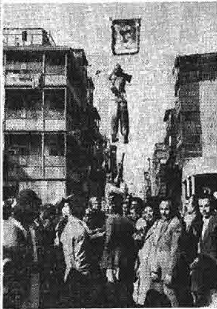
British Prime Minister Anthony Eden hangs in effigy in Port Said as Egyptian people express their determination to end imperialist rule. This demonstration took place as British and French forces withdrew from the country. Above effigy of Eden is portrait of Egyptian President Nasser.

losses already inflicted on the colonial empires of France, Britain and Holland, the loss of control over Middle-Eastern oil and the Suez Canal has a qualitative impact on the whole rotten structure of European capitalism. The full meaning of this radical alteration in the world situation has yet to dawn on the imperialist statesmen.