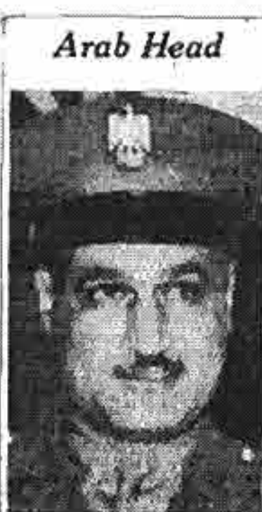
GEN. NASSER of Egypt stands currently at head of Arab national independence struggles. In Algeria, his supporters are ready for compromise with French imperialism, whereas leaders tied to Messali Hadj want complete independence.

Ferhat Abbas, a former leader of the reformist tendency in Algeria—his policy may be compared to that of Bourguiba in Tunisia—went to Cairo, apparently without interference from