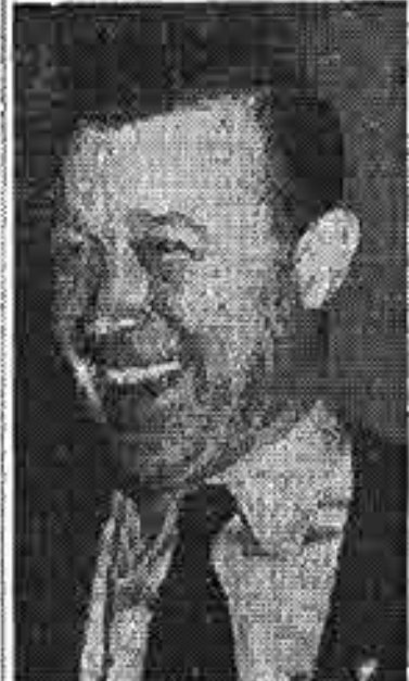
WALTER KEUTHER (President of the UAW), whose pro-Democratic Party policy is being challenged in effect by proposals in the UAW to build a labor party.