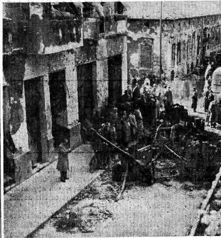
Budapest workers inspect two Russian artillery guns which they knocked out of action in the days following the Oct. 23 uprising. Despite the overwhelming military odds, the determination of the Hungarian workers to win socialist freedom made it possible for them to keep up their revolutionary struggle to this day.

fense Committee of the Hungarian Workers (Communist) Party to the Central Committee of the Hungarian Workers Party and the new government: