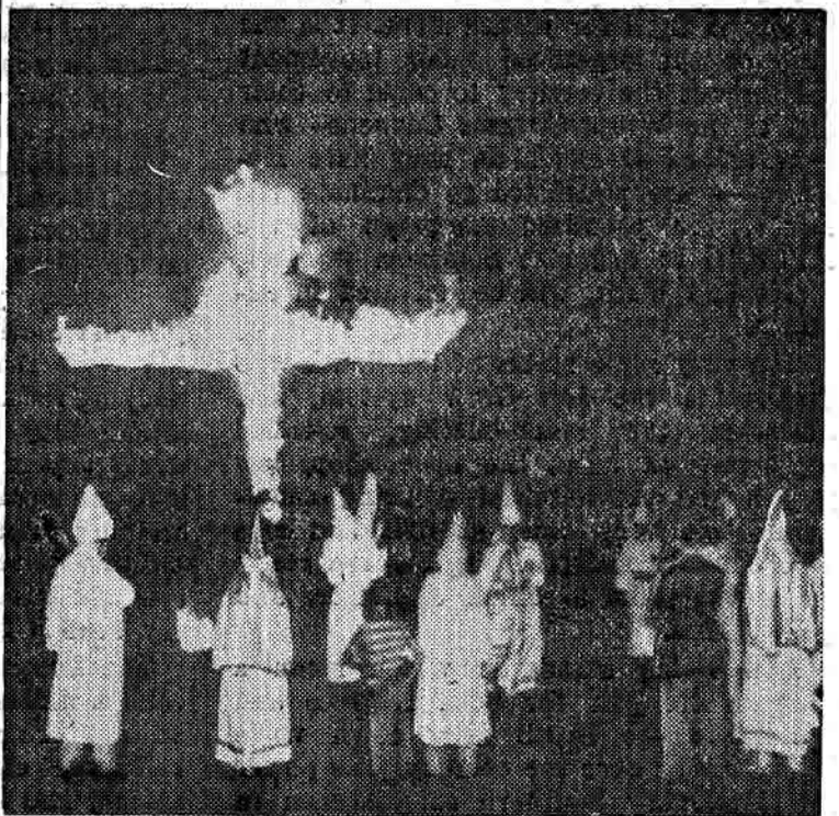
A typical cross burning scene at Ku Klux Klan meeting place at Stone Mountain, Georgia, 15 miles from Atlanta. Cross burnings and other fascist threats and violence are rife throughout the South now as Southern Democratic leaders head the fight to maintain racial segregation.