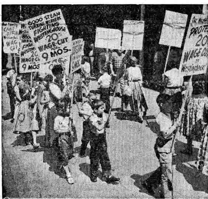
A delegation of wives and children of 6,000 Westinghouse strikers from the Lester, Pa. plant picket the New York office of the corporation demanding that the nine-month lockout be terminated immediately. Later the group went to Central Park for a picnic.