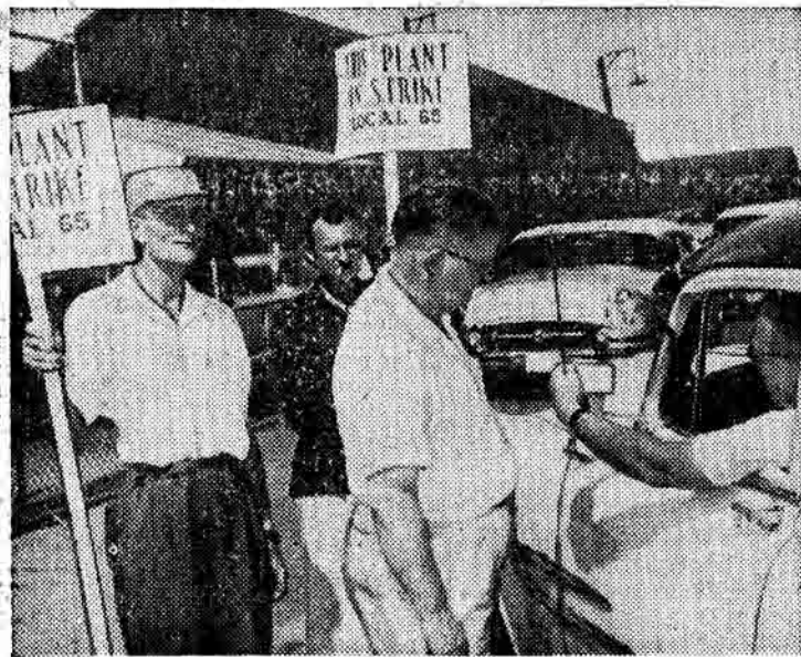
Picket signs of striking members of United Steelworkers Local 1397 and smokeless stacks are silent evidence of the steel strike at the Homestead plant of the U. S. Steel Corp. in Pittsburgh. 650,000 workers are on strike throughout the U.S.