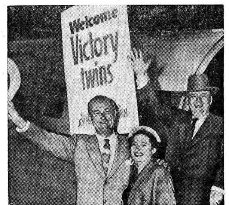
Senate Majority Leader Lyndon Johnson (left), Speaker of the House Rayburn and Mrs. Johnson in Washington after Johnson established himself as possible presidential contender by defeating rabid racist Gov. Shivers in fight for control of Texas delegation to Democratic national convention.