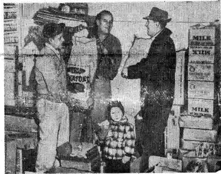
East Pittsburgh Westinghouse Local 601, IUE, distributes Christmas baskets of food to its members who have been on strike since Oct. 17. The union denounced a company offer of $100 Christmas loans to the strikers as a bribe. Union ranks remained solid despite the bleak holidays.