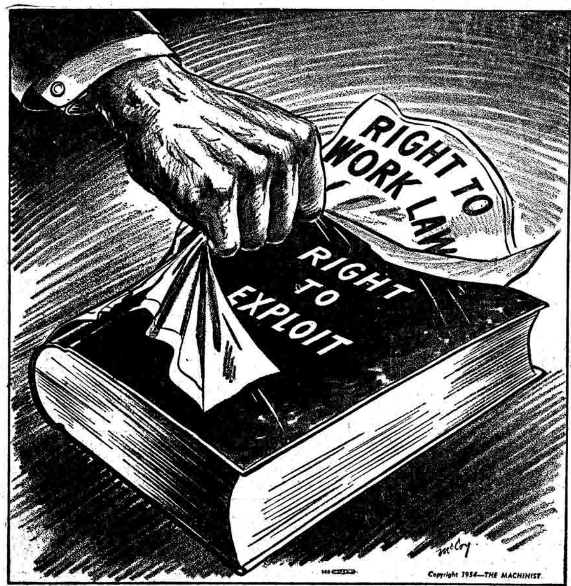
From The Machinist (IAM-AFL)