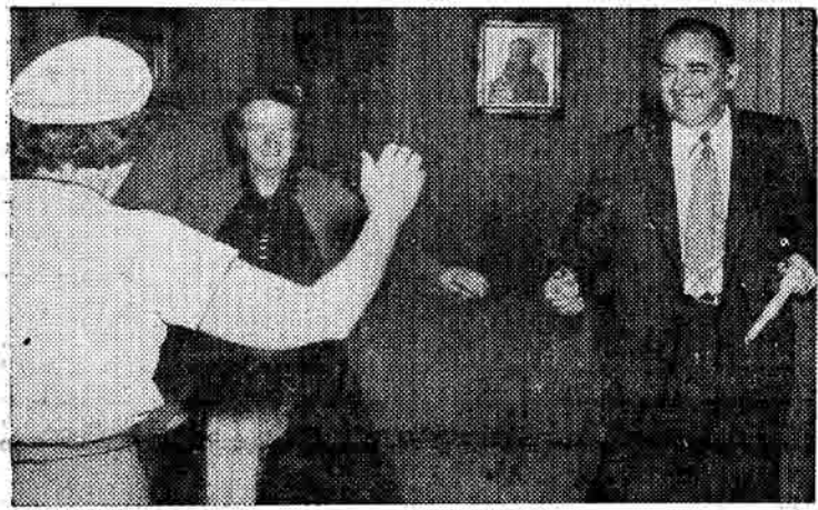
Fascist Sen. Joseph R. McCarthy (R-Wis.) enters Capitol building in Washington to be greeted by a joyful shriek from a woman admirer (left), who ran up and kissed him. She was one of several thousand frenzied McCarthyites who went to Washington to put pressure on the Senate against the censure of McCarthy now being debated.