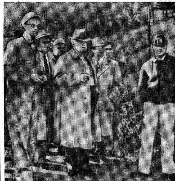
Pres. John L. Lewis of the United Mine Workers (wearing hat and raincoat) stands grimly with a group of mine and union officials at Farmington, W. Va., as they watch the sealing of a blast-wrecked pit of the Jamison Coal & Coke Co. Fifteen miners were trapped in the pit. The action was agreed upon as flames turned the mine into a powder keg.