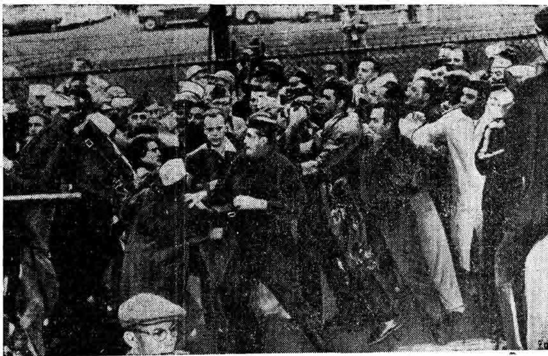
Mounted police ride into mass picket line at Square D plant in Detroit. The attempted strike-breaking by police violence aroused the CIO auto workers who swelled the picket line of the independent United Electrical Workers, despite the smear of "Communist-inflation" hurled against the striking union. The strike was settled. (See Page 1).