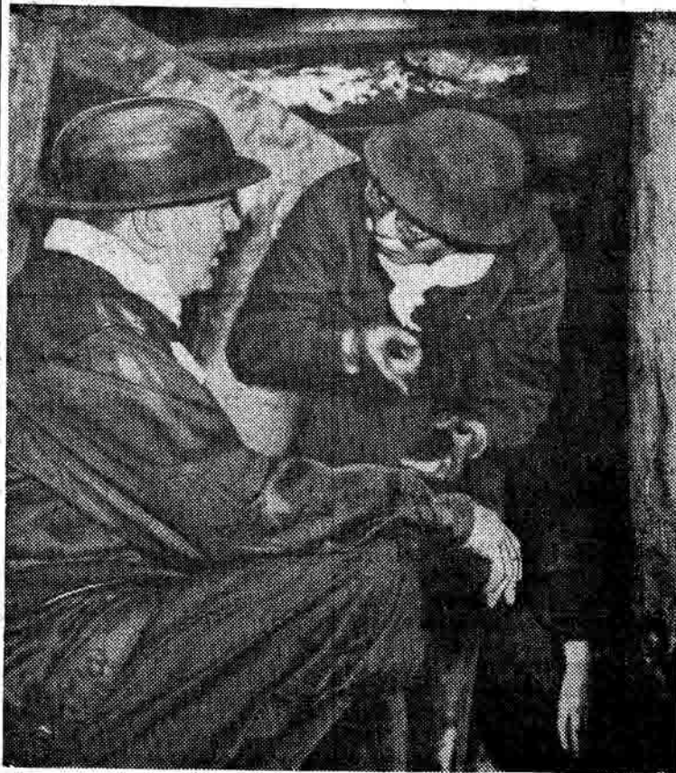
British-left Laborite Aneurin Bevan (left) chats with a Chinese miner as he visits the Kailan coal mines during the British Labor party delegation tour of China. Bevan returned to continue opposition fight against right wing of the Labor Party led by Clement Attlee at a recent party conference.

Times, a "skeleton detachment of a United States military mission arrived in Bonn some time ago to prepare the ground for close cooperation in the building up of the new German military establishment."