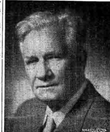
JAMES P. CANNON