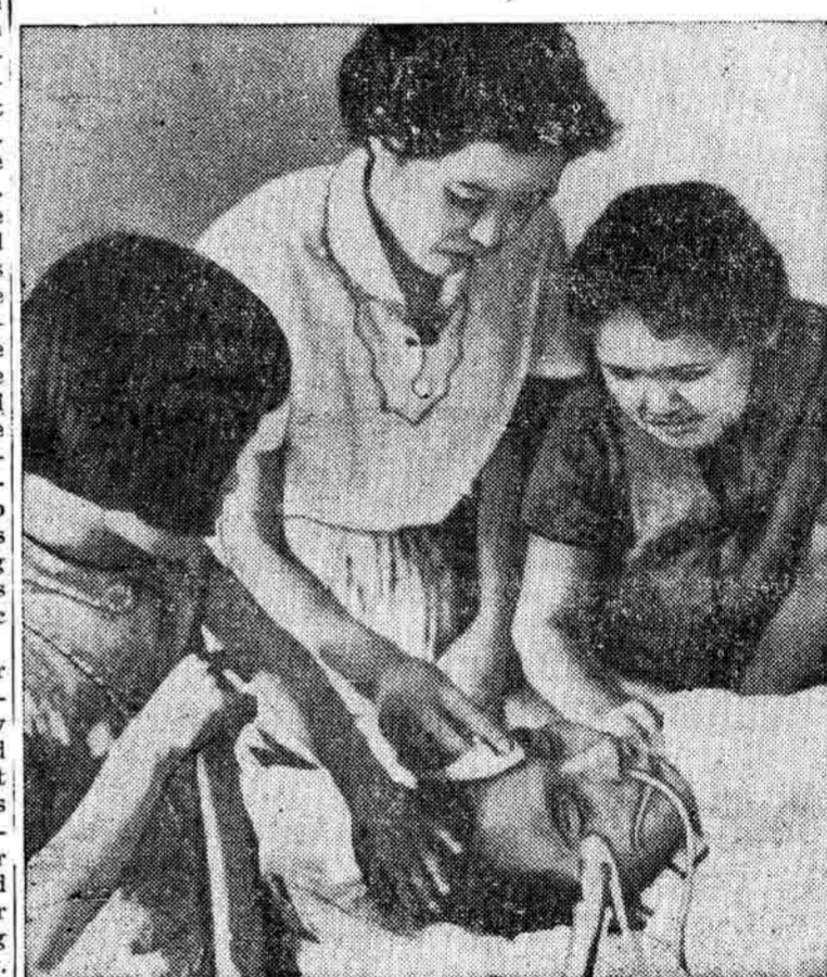
This Could Be You

It is high time that we listened to the indignant voice of humanity abroad, Weiss said. "Instead of blockading the Chinese people we should recognize the government of their choice and help them overcome poverty. Instead of preparing for war on the Soviet bloc, we should right things at home so that together with the people of all other countries we can end oppression and establish enduring peace."