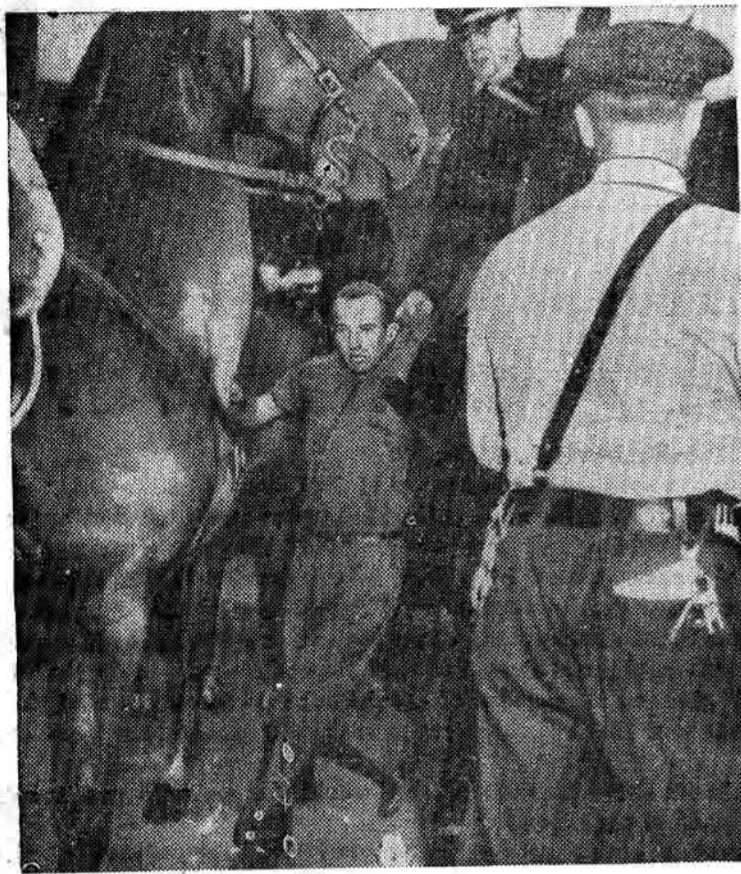
Mounted cops remove a picket from struck Square D plant in Detroit. Police violence and scabberding aroused CIO United Automobile Workers members to swell picket lines of the striking United Electrical Workers, although the striking union was labeled "Communist-infiltrated."