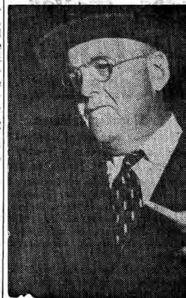
DULLES, who prefers to let Churchill carry the ball for the State Department when it comes to initiating a diplomatic move that might be interpreted by the McCarthyite axis as "appeasement to Communism."

In addition, the British ruling class dread another war. If and when the H-Bombs begin dropping,