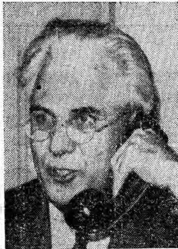
Sen. Homer Ferguson (R-Mich.) has introduced two bills on behalf of Attorney General Herbert Brownell which would give Subversive Activities Control Board life and death power over unions and allow employers a free hand in firing. The unions are officially opposed to the bills, which the Eisenhower administration is trying to blitz through Congress.

effect strike it out of the Constitution.