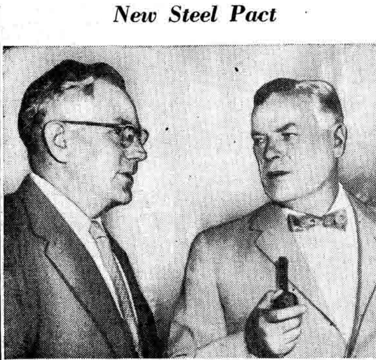
David J. McDonald, president of the United Steelworkers (CIO), right, discusses with Secretary-Treasurer I. W. Abel the new two-year contract signed in Pittsburgh with the U.S. Steel Co. The agreement, accepted by the rest of the industry, grants 9c. to 12c. an hour package increase. The agreement said nothing about guaranteed annual wage. That McDonald previously said he favored.