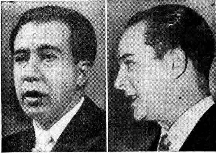
Former President Jacobo Arbenz Guzman of Guatemala (right) and his foreign minister Guillermo Toriello. Both looked to U.S. Ambassador Peurifoy instead of the workers and peasants to save their regime from Colonel Armas' rebellion. Peurifoy suggested they resign. They resigned and fled the country.