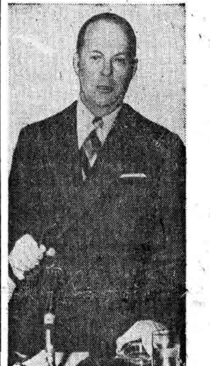
SEN. KARL MUNDT, who is probing McCarthy as chairman of the Senate Investigating subcommittee running probe.

In order to come out on top in the present dispute McCarthy does not have to prove the truth of his "blackmail" charges against Stevens, or to disprove Stevens'