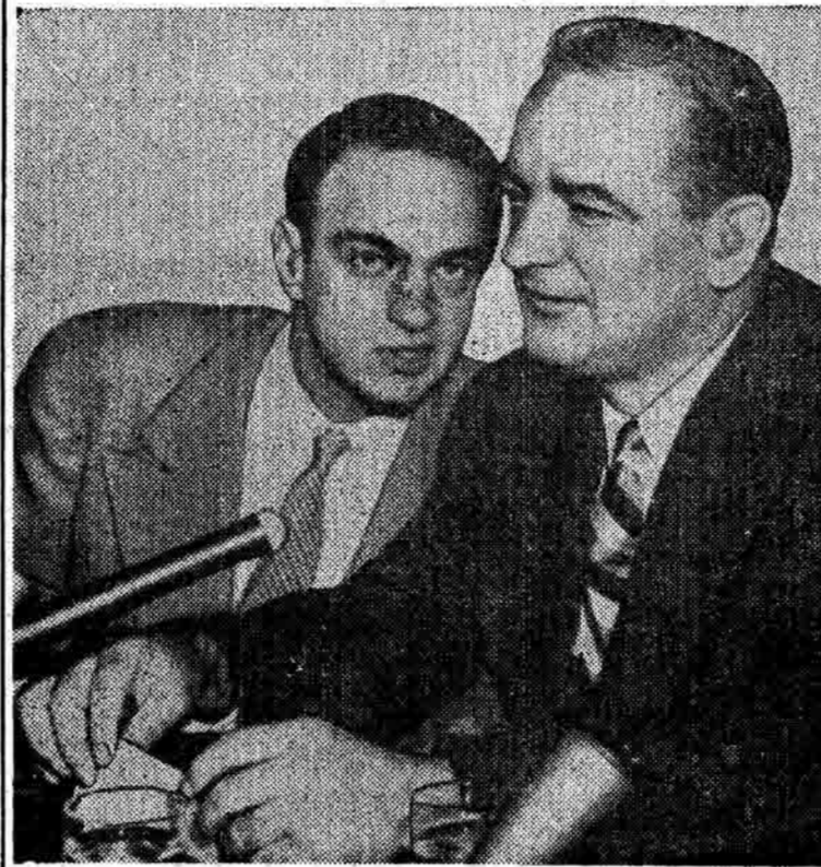
Sen. Joseph R. McCarthy and Roy Cohn (left), the fascist senator's chief counsel, shown in whispered conference during the McCarthy-Army probe before the Senate investigations subcommittee, which McCarthy runs. (See story on Page 1.)