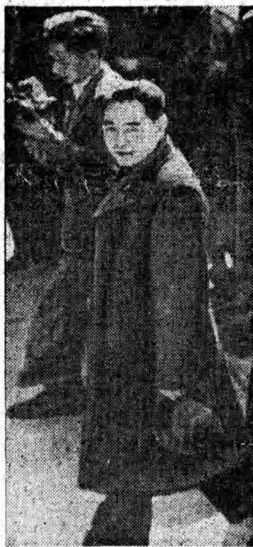
CHOU EN-LAI, Chinese Premier, shown arriving at Geneva Conference.

There is no question that American imperialism is receiving another serious reverse at the hands of the colonial revolution — this time in Indo-China. The Eisenhower Administration has had to back down from its initial intention of sending U.S. troops to the rescue of the French imperialists. This is a momentous event. In Korea, American imperialism was fought to a draw by the rising Asian revolution; in Indo-China, American imperialism has been halted dead in its tracks at least for the