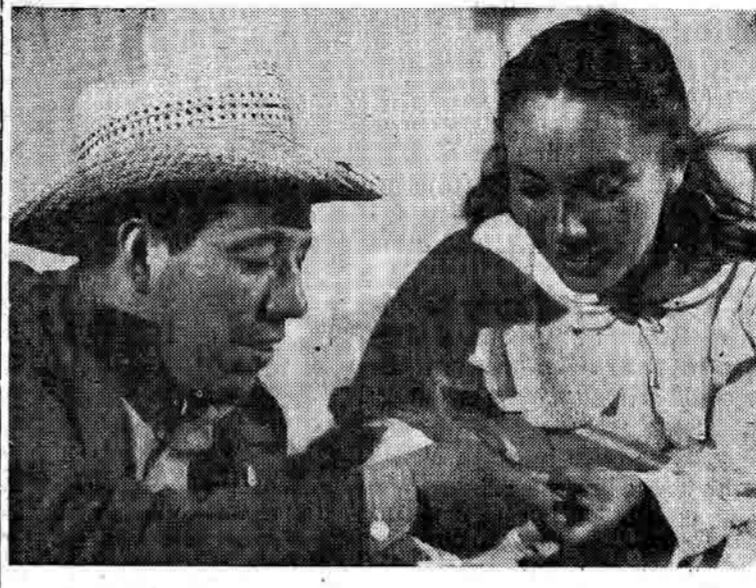
Rosaura Revueltas and Juan Chacon are the leading players of Salt of the Earth, independently produced full-length motion picture, which depicts the inspiring struggle of southwestern metal miners and their wives in a strike.

He is not around. He is a captive in an auto between two of the company sheriff's cops, his hands handcuffed behind his back. These Southern white supremacists take turns delivering vicious blows to his belly. He, too, calls out the name of his wife. They are equals in suffering.