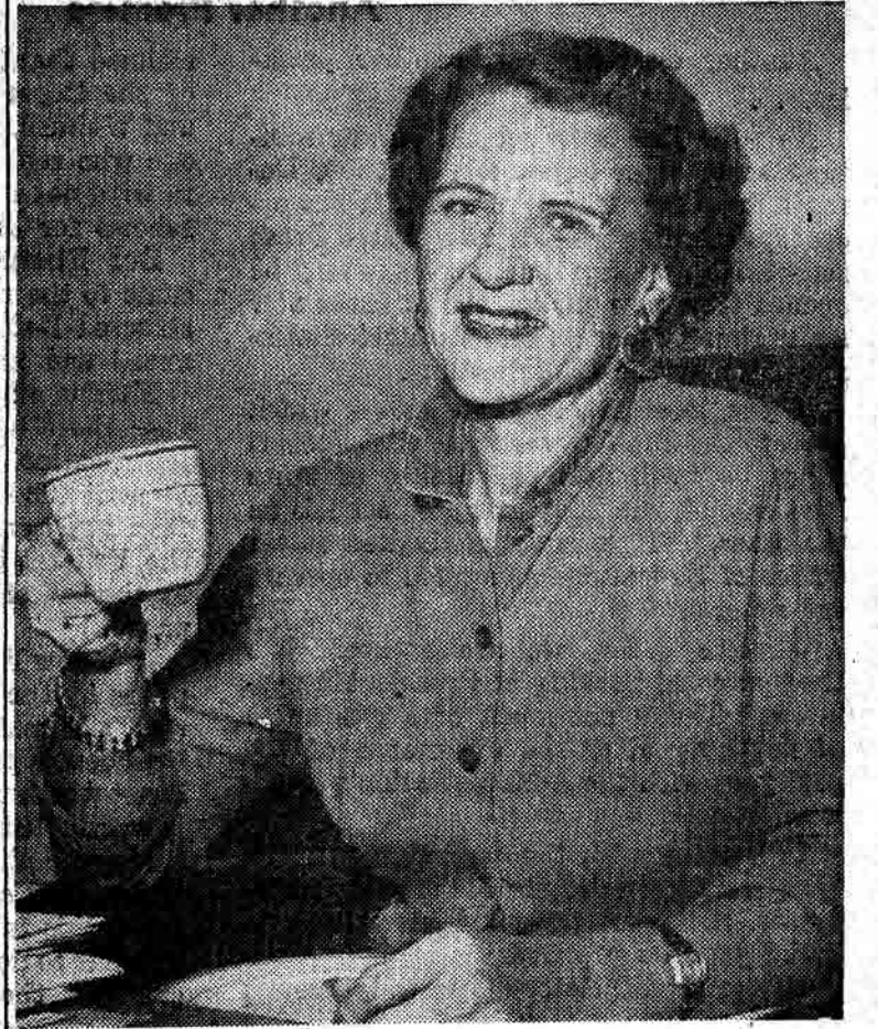
The "good golden brown brew" is becoming "golden" in more than color as coffee prices of $1.20 a pound are predicted. Rep. Leonore Sullivan (D., Mo.) is shown holding a cup of the precious stuff and saying something ought to be done about it. Coffee sales are reported falling rapidly.