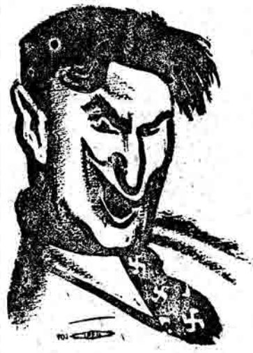
G. L. K. SMITH

Everyone in the audience knew he was referring to McCarthy. For more than an hour he had been praising the Senator from Wisconsin as the heaven-sent deliverer