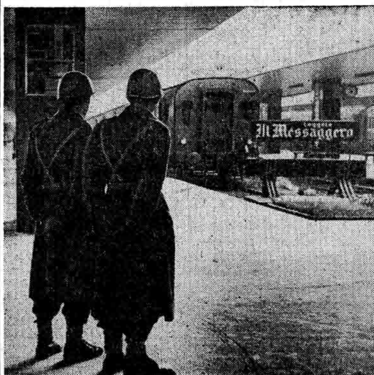
Soldiers guard the deserted platform of a railroad station in Rome during a recent strike by a million government employees for higher wages and other benefits. Only a few trains, operated by army engineers, ran during the 24-hour stoppage. Italy's economic and political crisis is deepening.

say, "The evolution of the crisis will be watched with some anxiety."