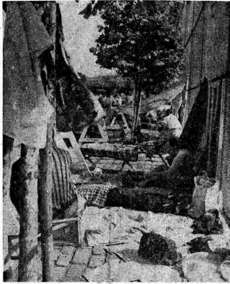
Does this scene foreshadow the fate in store for millions of American workers? This picture, made last July, shows men camped out for almost five days on sidewalk line waiting to apply for New York City laborer jobs paying from $51.90 to $59 a week.