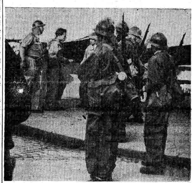
Young Arab, second from left, was arrested and searched for arms by Moroccan troops patrolling streets of Rabat, capital city. Troops tried to curb disorders which followed installation of French-backed Sidi Mohammed Moulay Ben Arafa as new sultan, succeeding deposed Sidi Mohammed Ben Youssef.