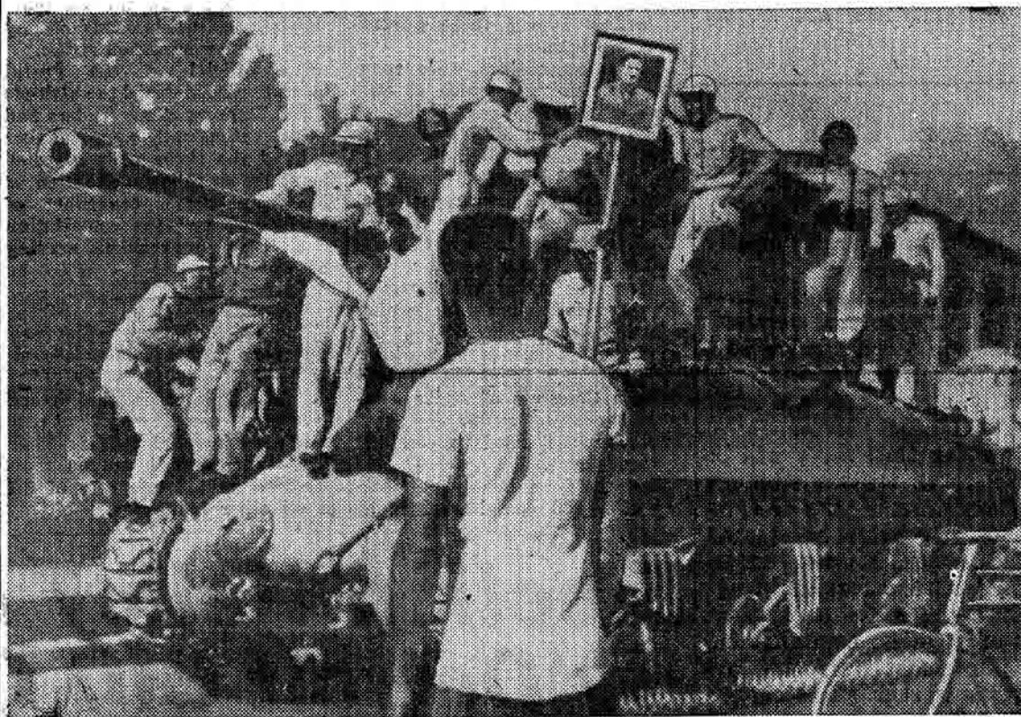
Pro-royalist troops stage triumphant parade through streets of Tehran following overthrow of Iranian Premier Mohammed Mossadegh, paving way for return of recently exiled young monarch, Shah Riza Pahlavi. Shah's picture is carried on tank. The monarchist coup caused rejoicing in Big Business circles in the U.S. and Great Britain. They expect to regain their grip on the oil industry which was expropriated under Mossadegh.