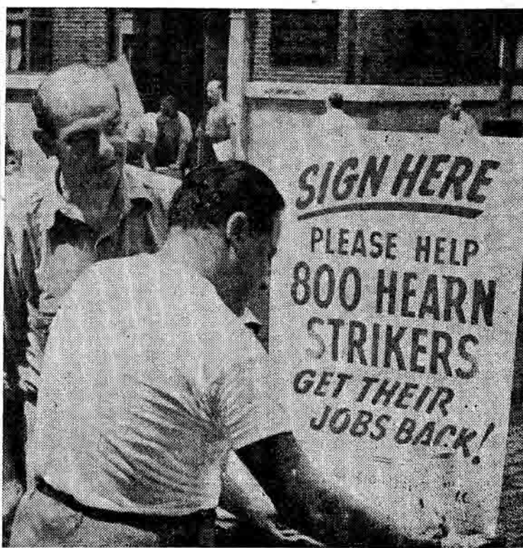
Over 150,000 New Yorkers have signed petitions calling on Hearn's Department Stores to settle the strike called May 14 by Dist. 65, Distributive Processing & Office Workers (CIO). Above, a union member gets another signature on lower Broadway. Mass picketing was barred by a court order.