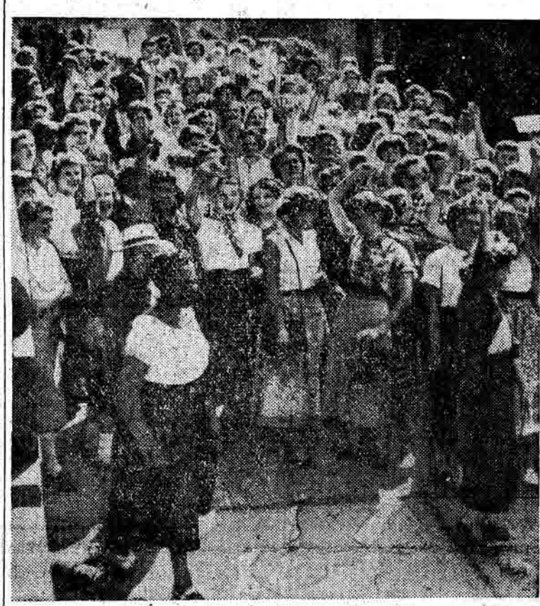
Disgusted with American Telephone & Telegraph Co. stalling in negotiations, 2,000 long-lines workers attended a one-day "continuous protest meeting" in Chicago.