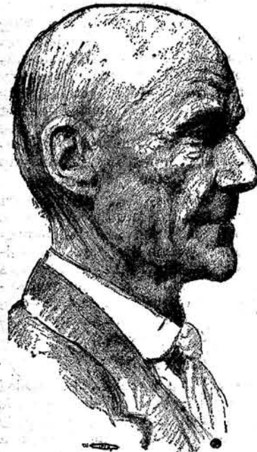
EUGENE V. DEBS

We ask you to do everything you can to help achieve this great and inspiring goal. Tell your friends about the Socialist Workers Party. Help widen the circulation of The Militant . Help us financially. The Socialist Workers Party needs funds urgently to get its message to the widest possible audience in the 1952 presidential elections.