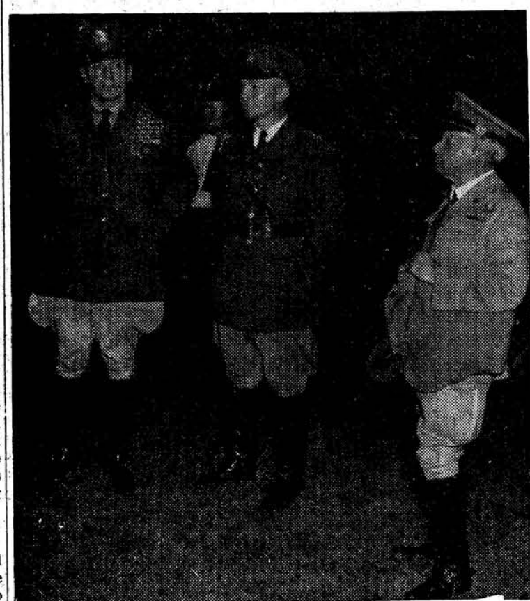
Most of the World War I generation know that Gen. MacArthur commanded the infantry, cavalry and tanks that drove the unemployed veterans out of Washington in 1932 to break up the Bonus March. But they don't know that Gen. Dwight D. Eisenhower was MacArthur's aide in this campaign. Eisenhower (center) is shown in this rare photograph with MacArthur (left) at the scene of the brutal attack on the hungry war veterans.