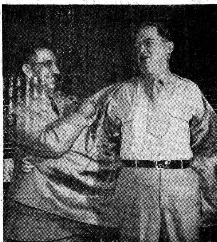
When the government "turned back" the railroads to the private owners, the only difference was in the wardrobe of the rail executives. They made a quick change from army attire to civilian clothes, but this didn't hide the fact that whether in their own name or the name of the government, the railroad bosses gave the workers a dirty deal.