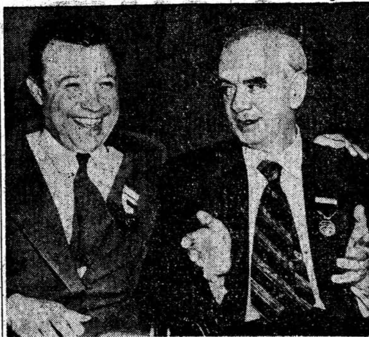
United Automobile Workers President Walter Reuther (l) backs his arm around United Steelworkers President Philip Murray at steel convention in Philadelphia, having pledged financial, moral and organizational support to the steel union in its wage fight. The auto workers are tied up in long term contracts.