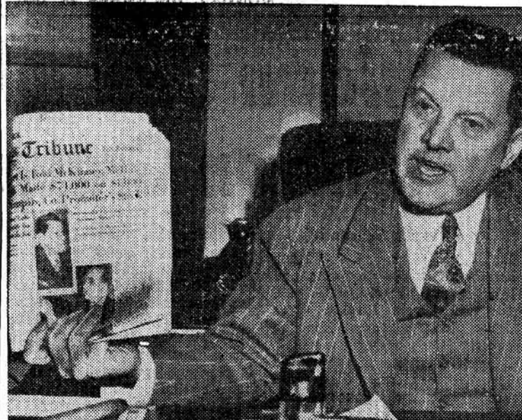
At Washington press conference, Democratic party chairman Frank E. McKinney holds up copy of story that revealed how he made $68,000 profit on $1,000 investment in Empire Tractor Co., which later went bankrupt. McKinney admitted making the profit but said it was "all ethical and honest."