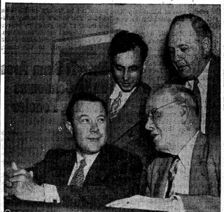
Scene at Washington meeting of the United Labor Policy Committee (left to right): Walter P. Reuther, President UAW-CIO seated alongside AFL President William Green; in the rear, James B. Carey and George Meany, Sec.-Treas. of CIO and AFL respectively. AFL's break with the ULPC was formally announced in the course of the Washington sessions.