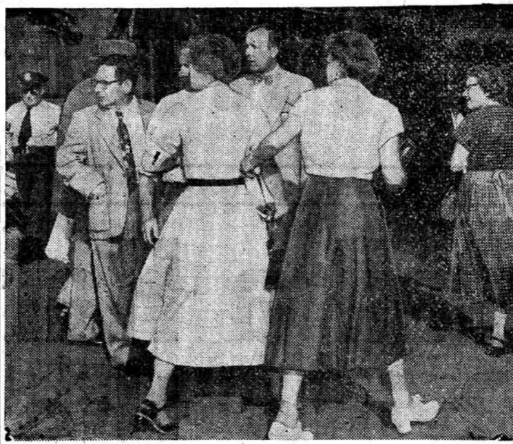
Foreign born men and women about to board a New York ferry for Ellis Island and possible deportation are among 39 rounded up in four cities. Their bail was revoked on order of the Justice Department, as the Truman administration expanded its witch-hunt.