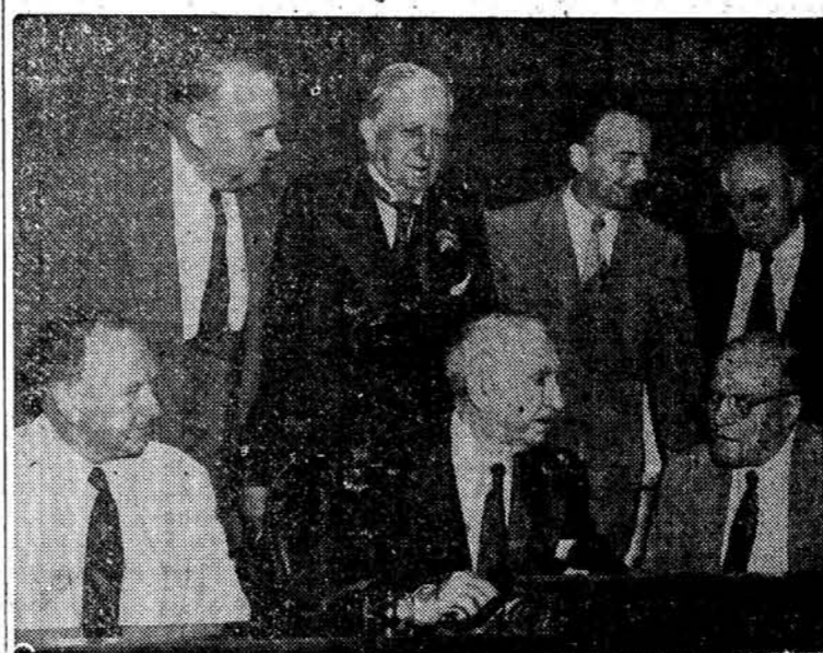
Here are the members of the Senate Finance Committee, figuring out the best way to make the low income families bear the brunt of the costs of all-out war preparations. In center is Chairman Walter F. George.