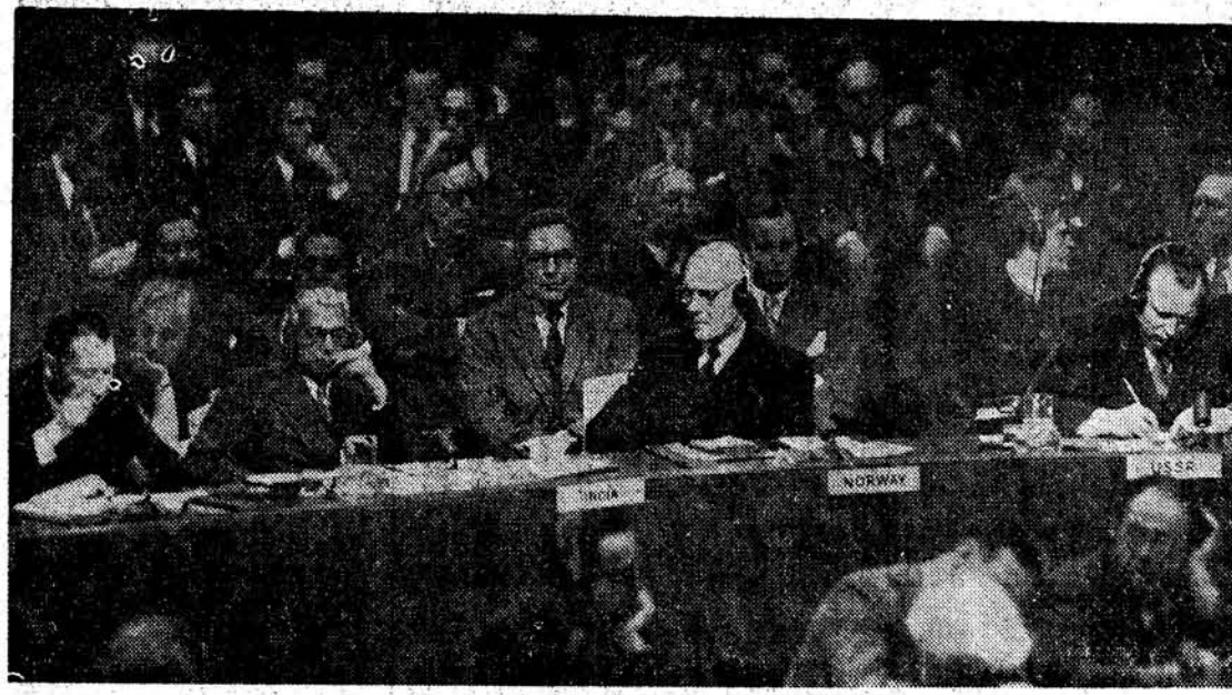
Wu Hsiu-chuan (L.), representing the Chinese People's Republic, is shown making his initial address to the UN Security Council meeting, in which he charged that the U.S. was the aggressor in Formosa and Korea. The Council, with India not voting, rejected the accusation by a vote of 9 to 1.