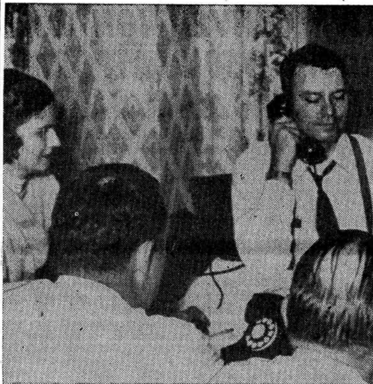
Running on a straight white supremacy platform, Gov. Herman Talmadge (above) won the Democratic primary race for governor against M. E. Thompson. Among other things Talmadge has pledged to never permit the "intermingling" of white and Negro students in Georgia schools.