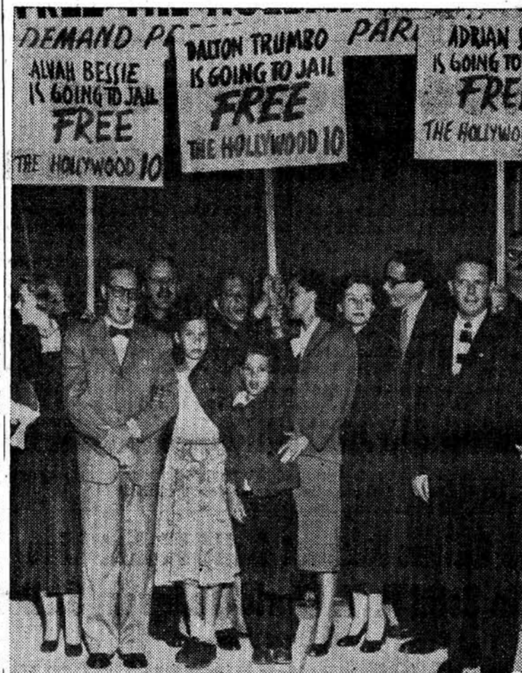
Surrounded by friends and supporters, screen writer Dalton Trumbo prepares to board a Los Angeles train for New York. One of the Hollywood Ten, he has started a one-year prison term for refusing to answer questions of the House Un-American Activities Committee concerning his personal political opinions and affiliations.