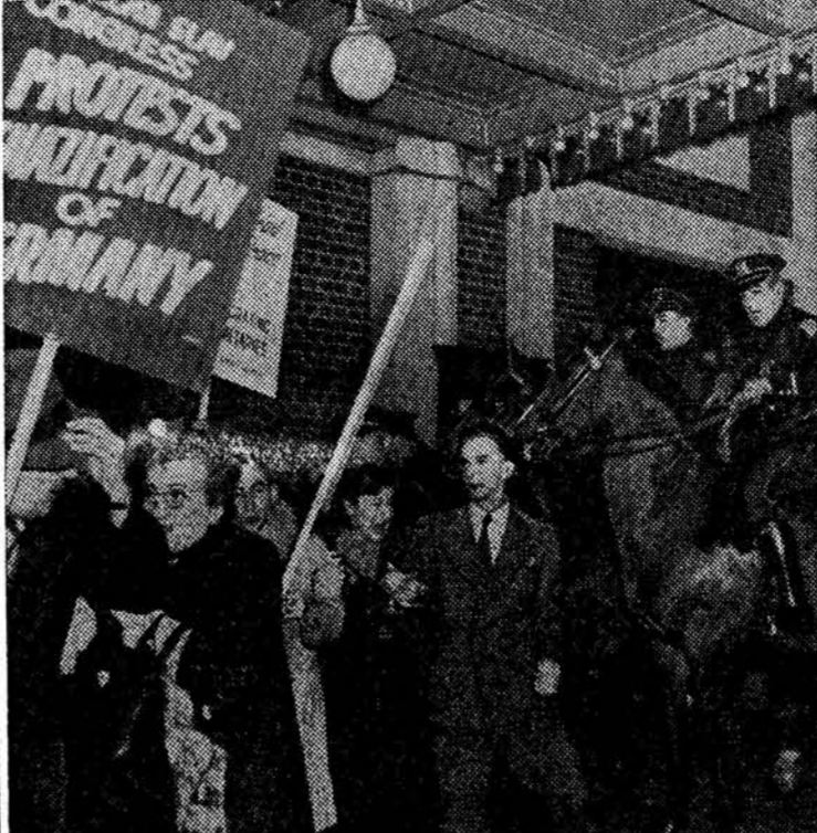
Riding roughshod into a picket line organized by the American Jewish Labor Council, New York cops seek to smash a demonstration outside Town Hall where Common Cause, an anti-Communist organization, was running a "Hold Berlin" meeting featuring Gen. Lucius Clay. A number of the 1,500 pickets were hurt.