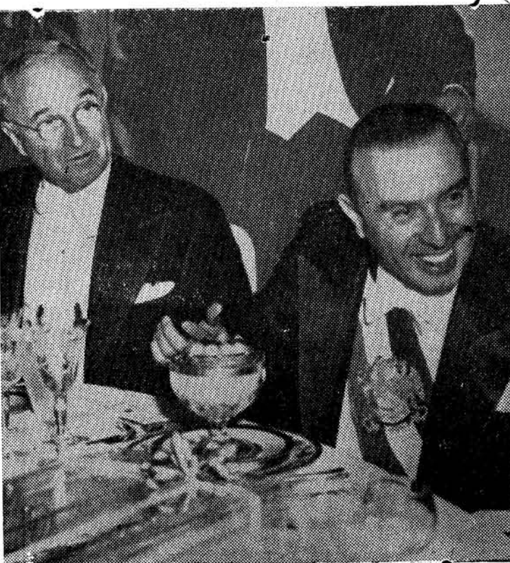
President Gonzalez Videla of Chile shown as he dined in Washington with Truman. Known as the "Henry Wallace of Chile," Videla was elected to the presidency with the support of the Communist Party. Once in office, he turned on his Stalinist allies, banned their party and jailed their leaders. He is urging the U. S. government to do the same.